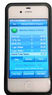
Our Remote Access Monitoring System as seen on an iPhone.

Cashless Vending Technology: It is well known that Americans are using credit and debit cards to make their purchases. It's about convenience! Numerous studies have shown that adding the option of the Credit/Debit Card Reader allows owners to raise pricing with better consumer tolerance, to win new business, and to increase overall sales.